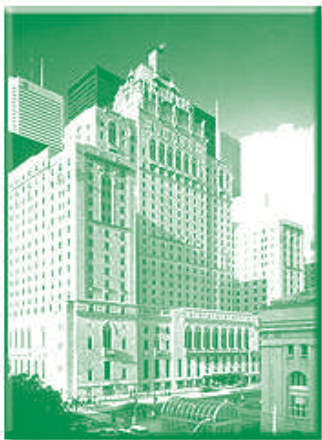
The Fairmont Royal York

I'm sure that everybody remembers the words 'Last Call!' If you don't, you were in worse shape than I was! Because this is the March issue of BETTER TIMES , this is a 'Last Call' to register early/buy your tickets now, get your Group to donate tickets, get involved, volunteer, help out, be a Greeter, whatever. There are loads of things to be done and helping hands are always welcome!